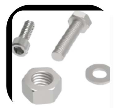
STAINLESS STEEL FASTENERS